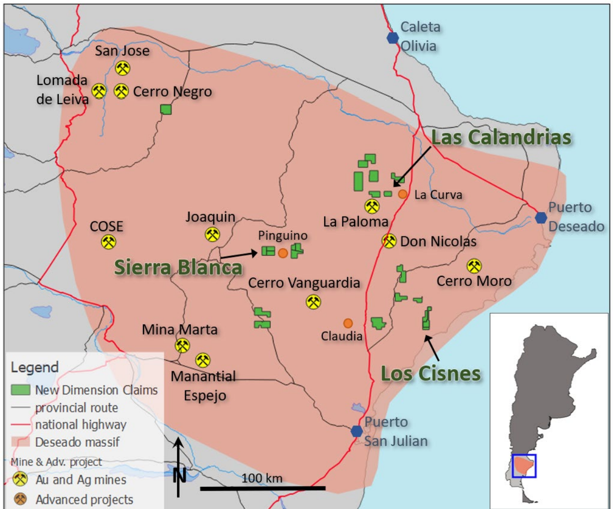
Figure 2: Las Calandrias Project – Main Targets and Mineral Resource Areas